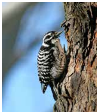
Left: Nuttall's Woodpeckers are year-round residents.

winter visitors, plus any migrants just passing through. That's the lure of migration birding—who knows what might drop in? Of course, we'll welcome sightings of year-round resident species such as Acorn and Nuttall's Woodpeckers, Yellow-billed Magpies, Orange-crowned Warblers, Western Bluebirds and many others. This portion of the field trip will end by noon, and for those who want to take in some coastal species, there is an optional extension of the trip to Gaviota State Park.