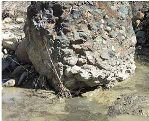
Conglomerant boulder in Upper Oso Canyon.