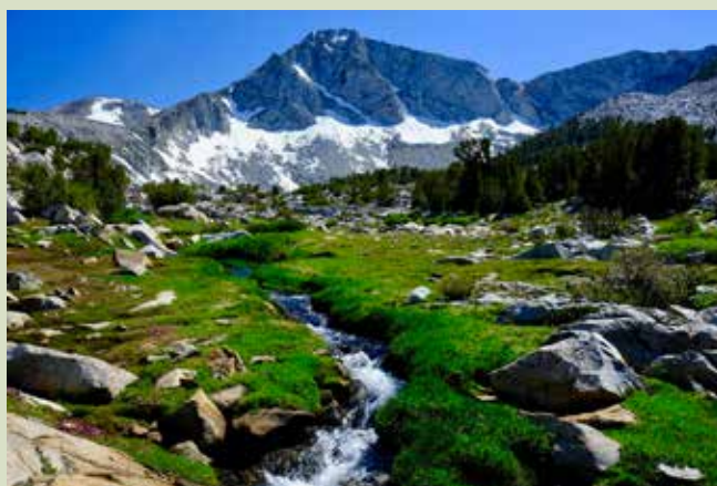
Yosemite National Park wilderness area.