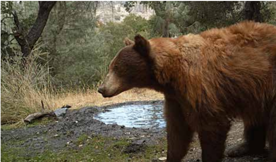
Black bear enjoying a Sedgwick Reserve water hole.

For the past eight years, motion-sensing cameras at the UC Sedgwick Reserve in Santa Ynez have captured images of wildlife that come to drink, and sometimes play, at the various “water holes” throughout the former Sedgwick Ranch.