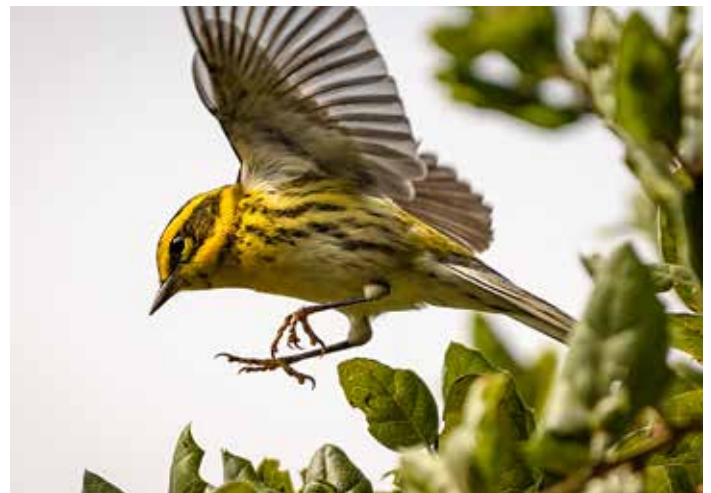
Townsend's Warblers are winter visitors.