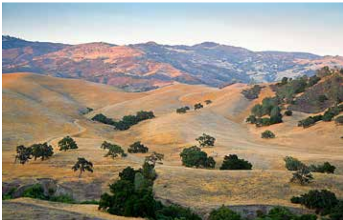
Oak savanna at the UC Sedgwick Reserve.

For thousands of years California oak woodlands have provided a bounty of ecological goods and services to human societies. In the 250 years since European settlement, oak woodlands have undergone significant changes in human use and associated landscape and ecosystem structure, composition, and function. Some keystone species,