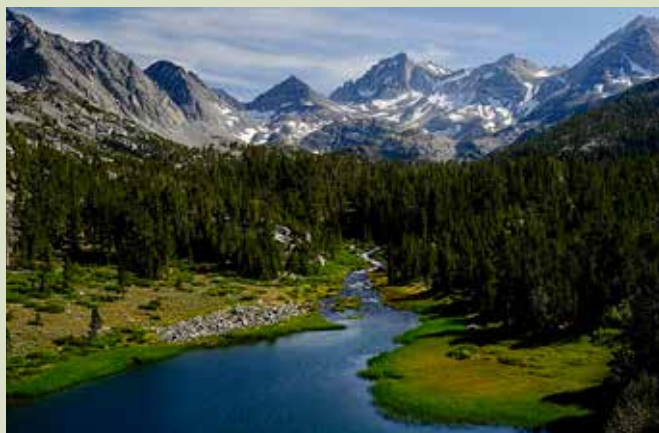
John Muir Wilderness.