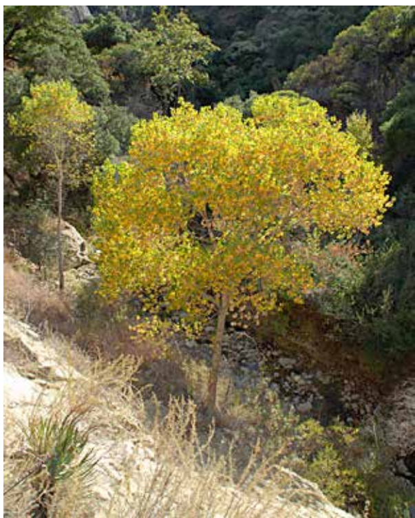
Fall colors in Upper Oso Canyon.

Lunch at the Nineteen Oaks knoll offers beautiful views of Little Pine Mountain and the surrounding backcountry, with the possibility of catching some early fall color across the landscape.