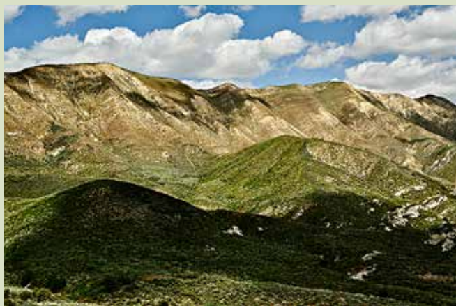
Hurricane Deck in the San Rafael Wilderness from Potrero Trail.