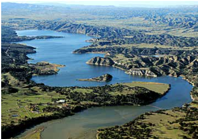
Aerial view of Cachuma Lake, near capacity.

Spend a crisp fall morning birding on our local lovely reservoir, Cachuma Lake. Seasoned birder Jay Bishop will lead a two-hour boat trip on the lake, which is now over 75% full. We can expect to see many local birds of prey and migratory waterfowl. The high lake level means a greater variety of habitat for visiting and resident birds. Open, deep areas of the lake are prime diving habitat for Common Loons, Scaup, Ruddy Ducks, Common Mergansers, and Western and Clark's Grebes. Mud flats and shallow