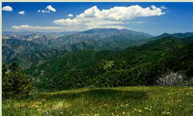
San Rafael Wilderness viewed from Catway Road.