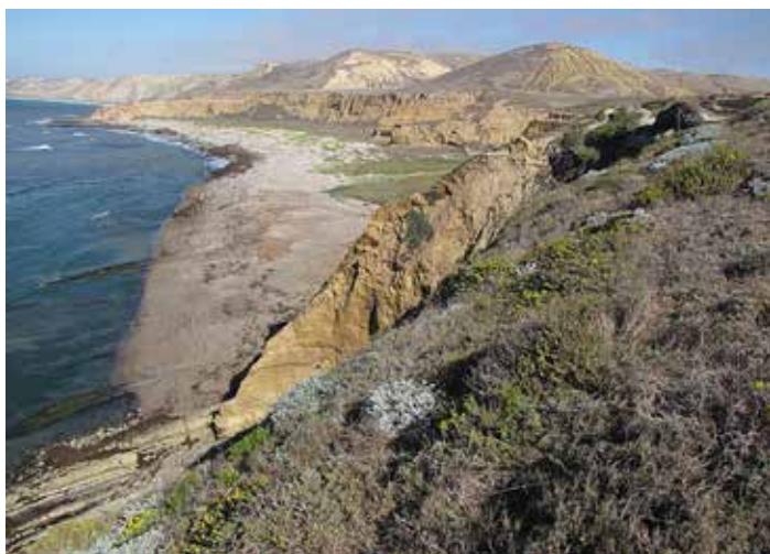
Santa Rosa Island of California's northern Channel Islands.