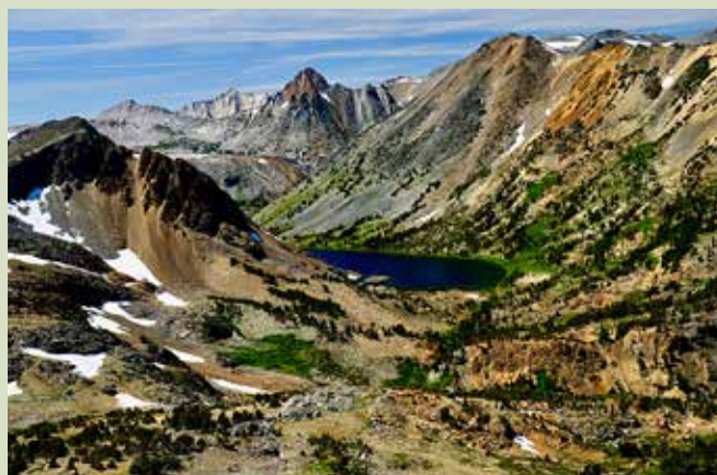
Hoover Wilderness.